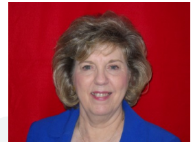
Wishing You & Yours A Happy Holiday Season Pineland CSB

gether we can ensure the road to recovery will become more a reality. At Pineland, our goal continues to be making a difference in the lives of those we serve. Our dedicated and talented workforce of 500+ have worked hard and faced many challenges in 2009, but all pledge they are "on board" and eagerly look forward to 2010.